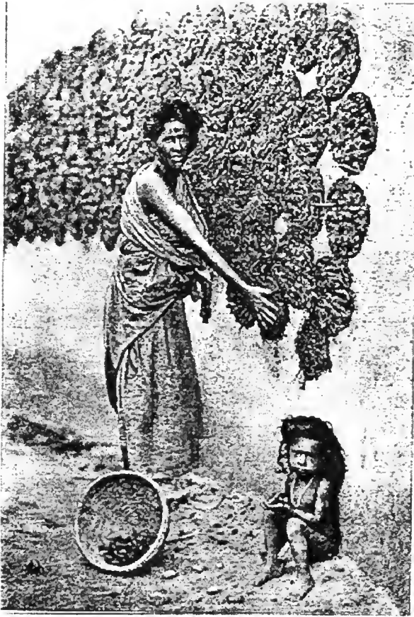
Woman of southern India preparing flat cakes of combustible dung.