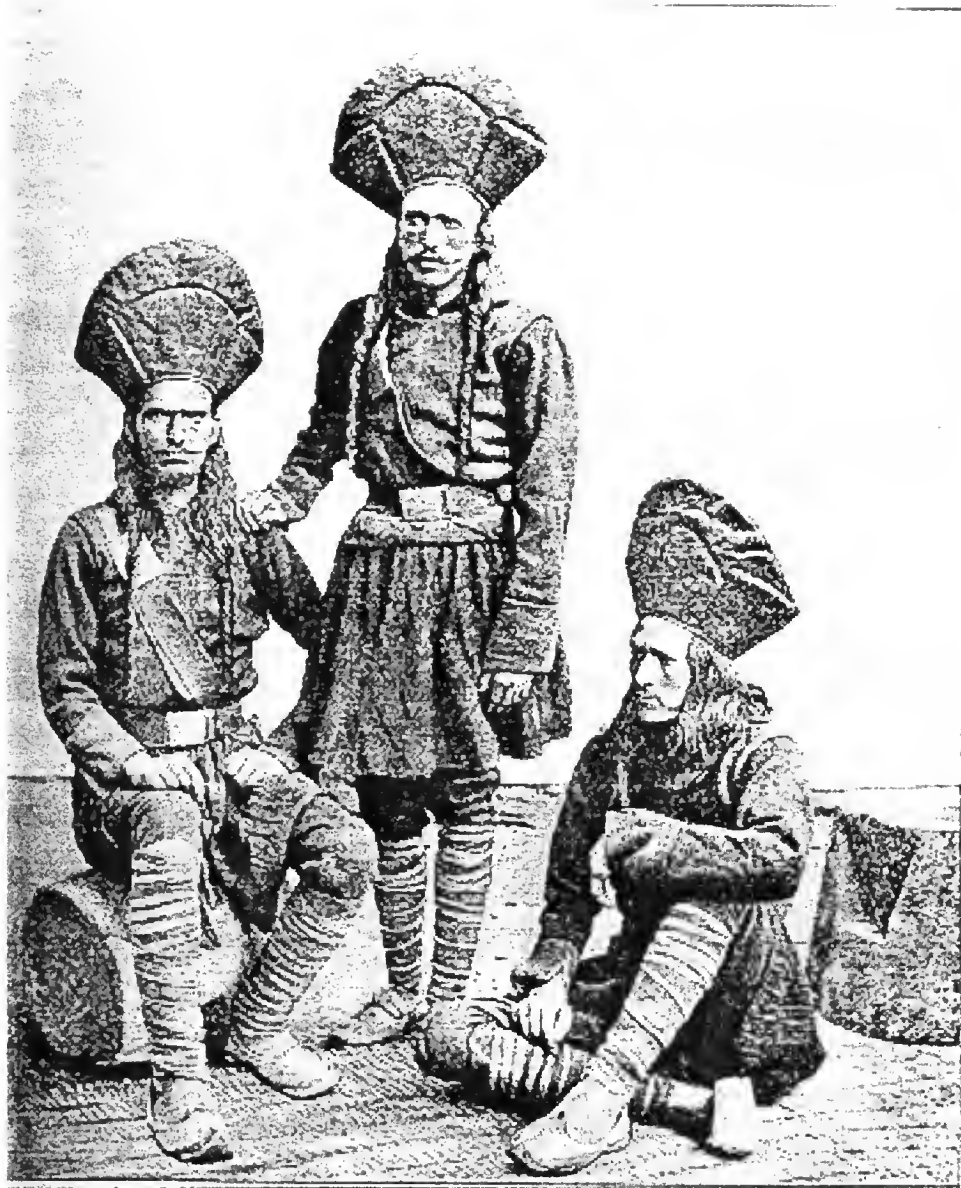
Soldiers of Cashmere

Cashmerians have been cited as one of the most striking populations of India due to their impressive physical type and fine skin, which is fairly white. Their women are renowned for their beauty. The Cashmerians are not very tall, but they are robust. Their noses are aquiline, and their hair and beard abundant.